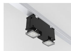
Mounting on trunking (Mounting brackets included)